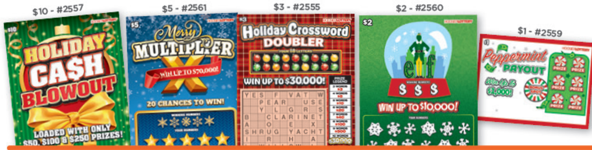
ELF and all related characters and elements © & ™ New Line Productions, Inc.

Remove the below tickets from ALL Bin Sets and Self-Service Machines